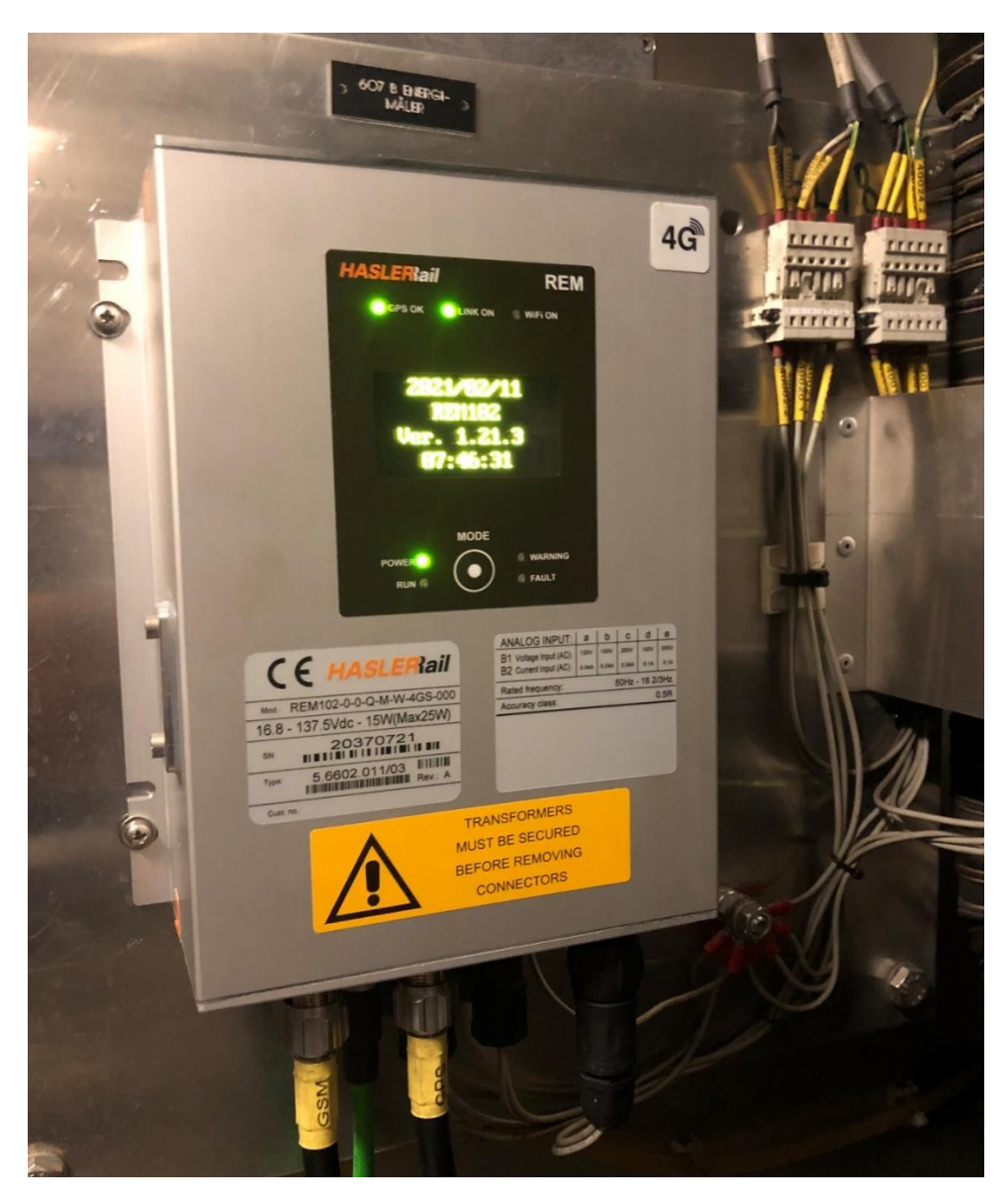
Example of an energy measurement unit installed in a locomotive