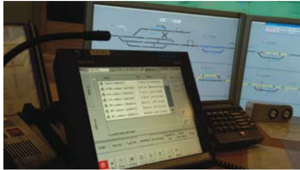
GSM-R terminal.

logical solutions that can contribute to increased competitive strength. Even without any ambitions to be at the forefront of technology internationally, considerable R&D investment would be required to produce the desired results with a market-oriented strategy.