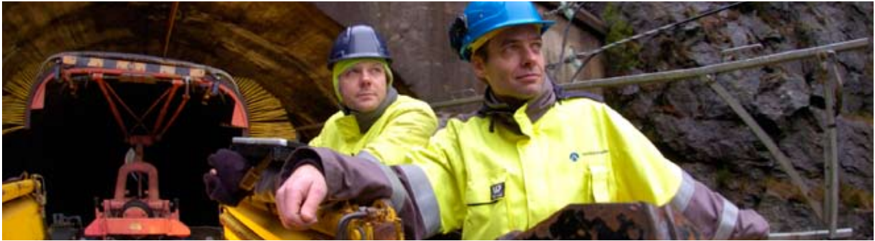
Overhead contact line installation.

development and sales of ERTMS ahead of life-extending measures in older technological solutions. The National Rail Administration "as a small-scale" railway administration will be "forced" to change technological platform.