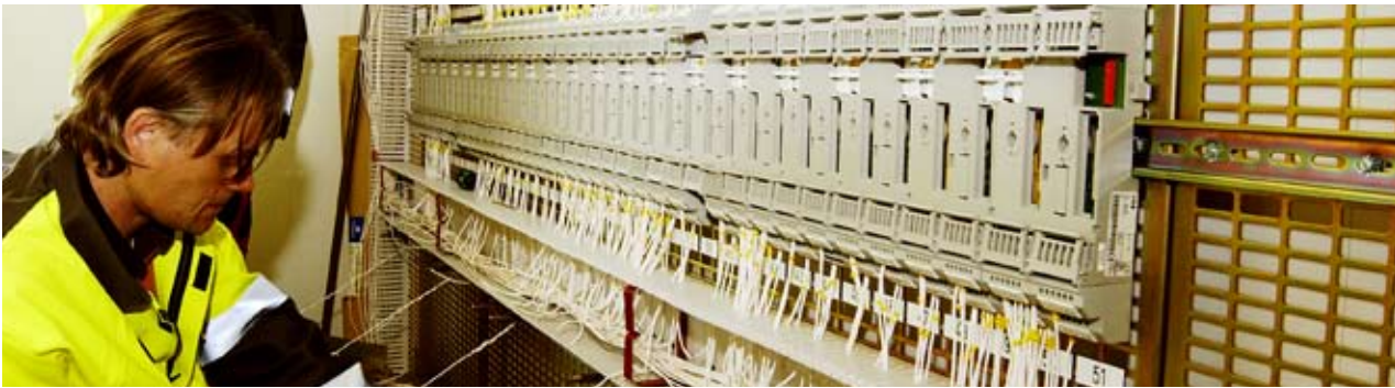
Part of safety installation.

Administration and other railways which traditionally have a renewal cycle of 30 to 40 years or more for the “heaviest duty” facilities.